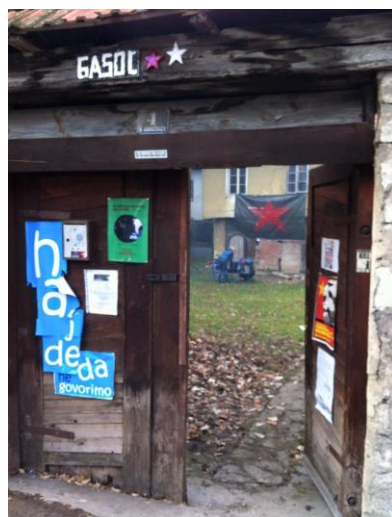
Photos: Entrance to the house; discussion and video screening in the garden of BASOC; Logo of BASOC