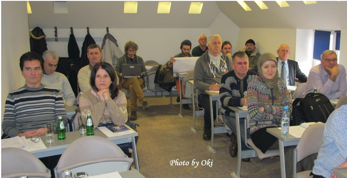
Photos taken during the meeting on 25 th January 2016 in Banja Luka (Presentation of activities after the first implementation period)