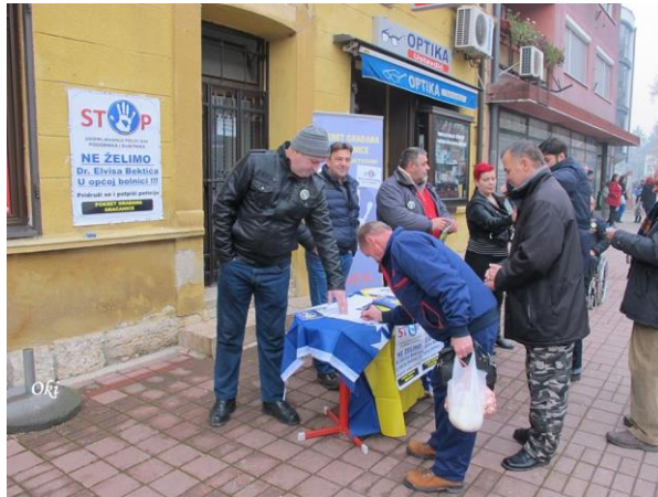
Photos: Informing citizens in Gračanica about the Movement and its activities; Publication of campaigns such as: "You are an active citizen and therefore you need to become informed, create your own opinion and ideas, and work together with others in order to strengthen the community."