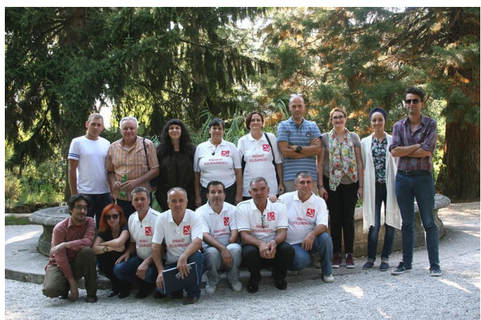
Photos: p.11: Protest camp in front of the government of canton Tuzla; p.12: Meeting with the Austrian Minister, Mr. Sebastian Kurz in the Austrian Embassy in Sarajevo in June 2015; Visit and support for the reopening of the National Museum in Sarajevo in summer 2015.