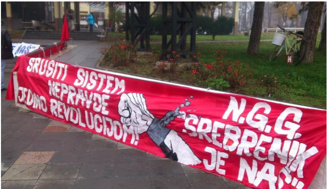
Photos taken during the public tribune and protests in the city centre.