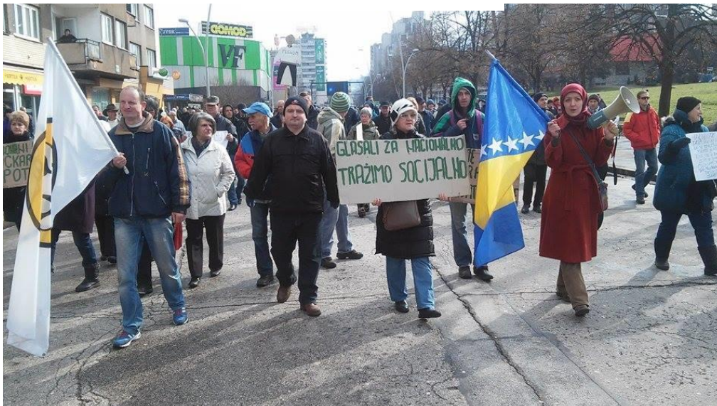
Photos of the office of the Plenum, and protests in Zenica