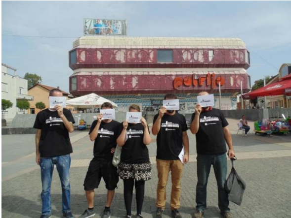
Photos: street action: “Food NOT violence”; protest singing at Kozara against manipulative discourses and propaganda to rewriting the past events during WWII and the role of the citizens during that time; Protest in the centre of Prijedor.