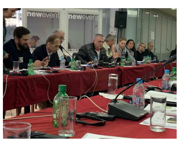
Representatives of Civil Society Groups in BiH talking about activism and social engagement in the country