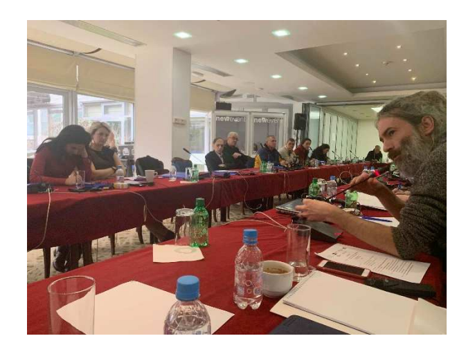
The participants discussed on alternatives in the future on the second day of the conference