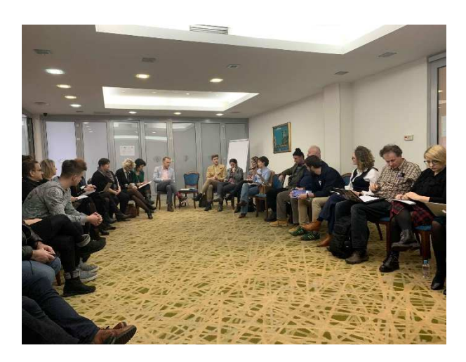
Discussing the challenges of activism and social engagement in SEE